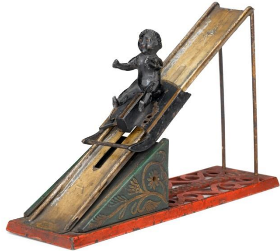
The only known example of a rare coasting bank, estimated at $30,000-50,000, to be sold at Freeman's on November 13.

Although there is no patent information available for the Coasting Bank, certain strikingly conspicuous features warrant an attribution to the illustrious bank designer Charles A. Bailey. Bailey worked for J. &