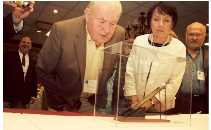
Collectors take a closer look during an unveiling at the annual Mechanical Bank Collectors of America banquet.