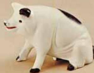
23-060 Pig Bank 4 1/4"