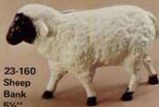
23-160 Sheep Bank 5 1/2"